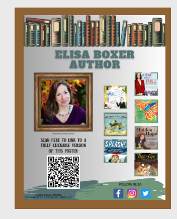
"CLICKABLE" AUTHOR POSTERS TO REACH YOUR PURCHASE SITES, SOCIAL MEDIA AND MORE