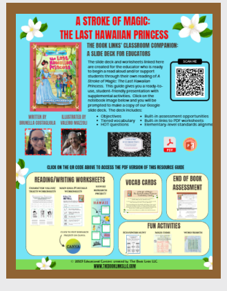
ONE PAGE RESOURCE GUIDES WITH A CLASSROOM COMPANION SLIDE DECK